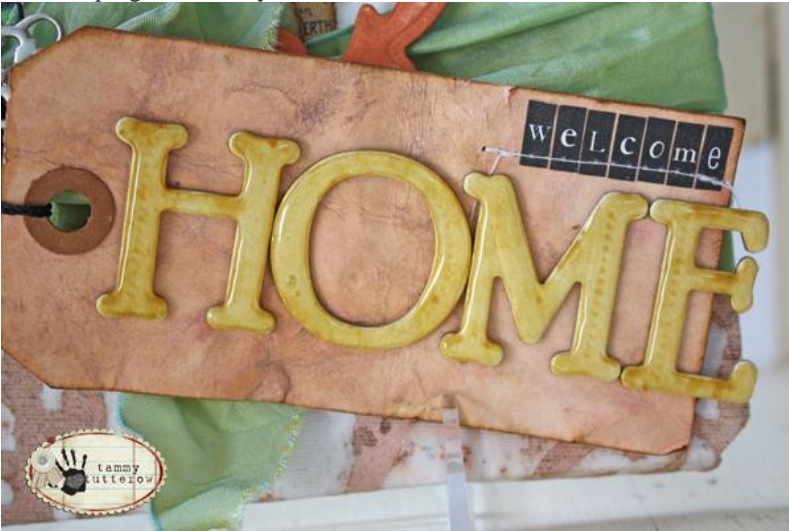
I used chipboard letters to a distressed shipping tag, spelling out the word HOME. I painted each letter with Golden Goddess Glimmer Glam and then added a nice thick coat of Glossy Accents.