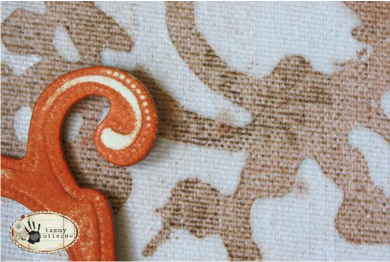
The stamping adds a very subtle detail.